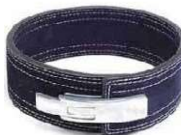
Not legal belt